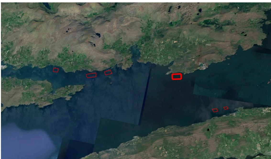
Figure 4. Locations of other fish farm sites within Bantry Bay.

An application for a large-scale mechanical harvesting operation of kelp has been approved and is underway. The licence covers about 1,800 acres.