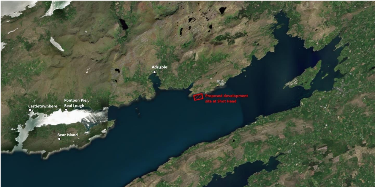
Figure 1. Location of the proposed salmon farm at Shot Head in Bantry Bay, indicating the locations mentioned in the text.